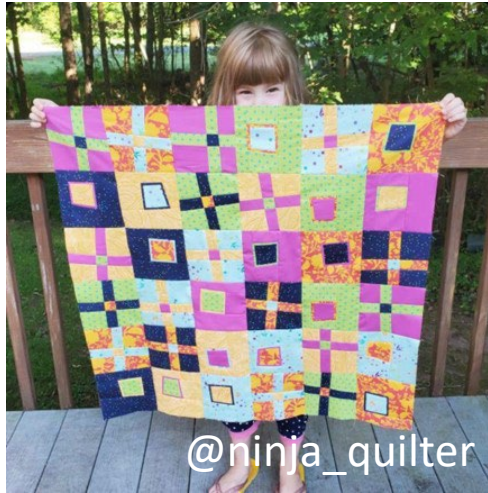
@ninja_quilter's version uses Tula Pink prints in a variety of colors and color values.